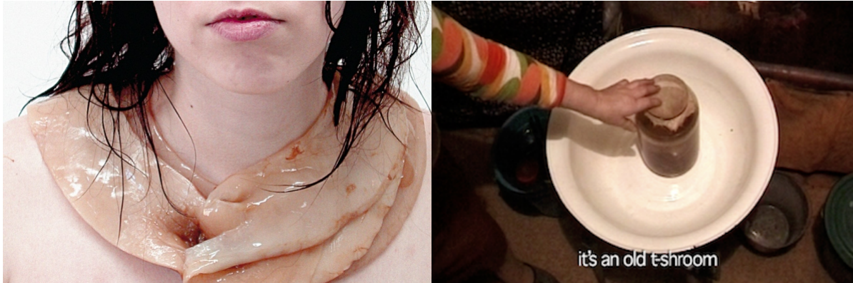
t-shroom (since 2002)

The tea-mushroom, grown in a 3 litter glass jars in homes across Post-Soviet territory, is an agent of open network, trading from home to home, crossing borders from country to country. The T-shroom project is an enterprise, investigating the life and systems of distribution of this social mycelia in a marketing and consumer driven world paradigm. By adopting a t-shroom, one becomes a symbiosis partner joining the network of mushroom-based autonomy. http://open.x-i.net/tsene/indexs.html