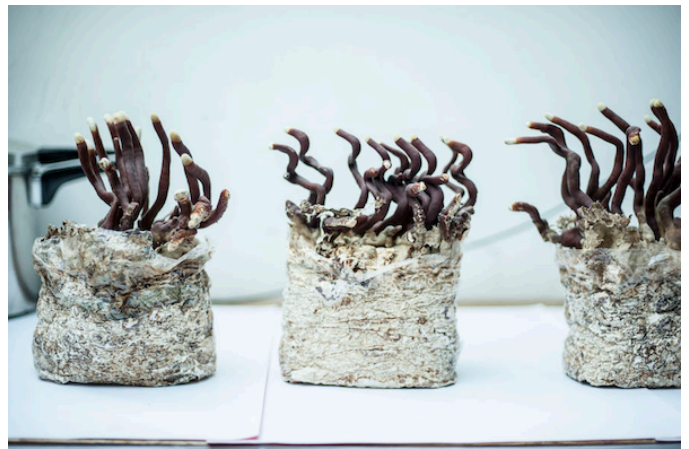
myco-logick at STWST48 (2015) and STWST48x2 (2016)