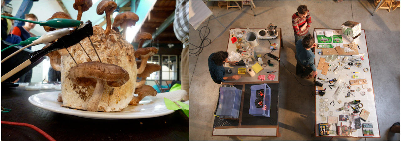
workshop radio mycelium tutorial at [foam], Brussels. (2011)