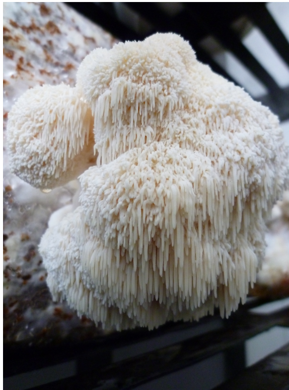
mushroom grown by Taro, 2016