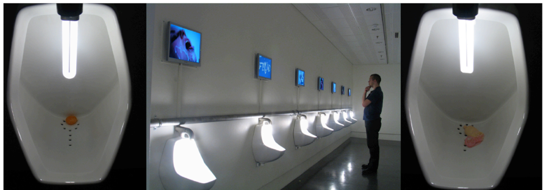
Installation view at Kunstneres Hus, Norway (2004)

After living 20 years (1977 – 1997) in New York city, I assigned myself as a nomad moving/working in Eurozone until settled in Paris in 2007. FLUID concept written in 2000 after the release of I.K.U. was an attempt to reconcile with the pain of lost intimacy. In 2009, I also started writing a new concept/scenario for I.K.U. sequel, UKI, which ultimately claims virus as my own salvation.